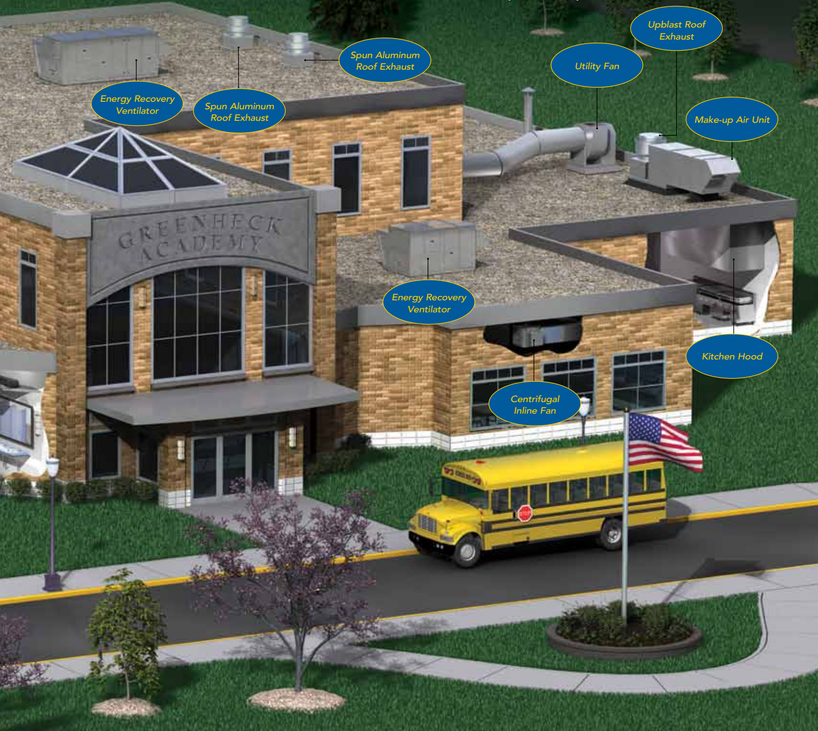
This illustration highlights the various Greenheck products available for school buildings; it does not represent an actual ventilation application.

love. Our extensive testing ensures that you can select more products with certifications from AMCA, UL, cUL, ETL and CSA than from any other manufacturer. Engineering expertise and industry knowledge deliver value you can depend on, every school day.