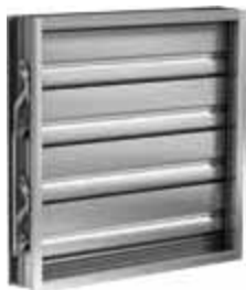
Model ICD-44 and ICD-45 are AMCA Licensed for Air, Efficiency and Air Leakage