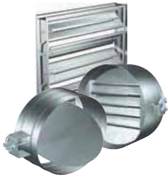
Model VCD-20, 40 are AMCA Licensed for Air Model VCD-23, 33, 34, 43 and SEVCD-23, 33 are AMCA Licensed for Air Leakage and Air