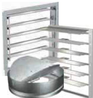
Model BD-100, 320, 330 and ES-30, 31, 32 are AMCA Licensed for Air Leakage and Air