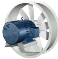
AX Short Casing