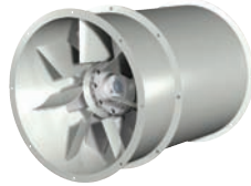
AX Vane Section