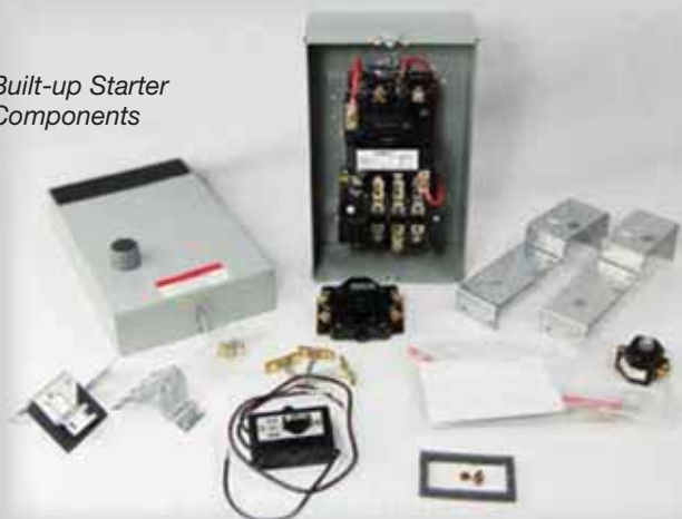
Built-up Starter Components

Even with good communication, problems can occur when "built-up" starters use mismatched, incomplete or poor quality components.