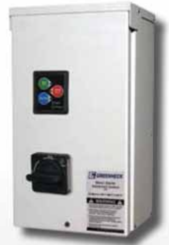
Model MSAC shown with optional disconnect switch