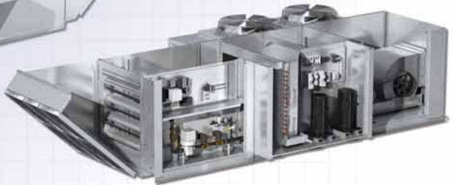
Direct Gas-Fired unit with Integral Packaged DX Cooling

Condenser and Evaporator Coils have copper tubes with permanently expanded aluminum fins. Evaporator coils are mounted on a stainless steel drain pan.