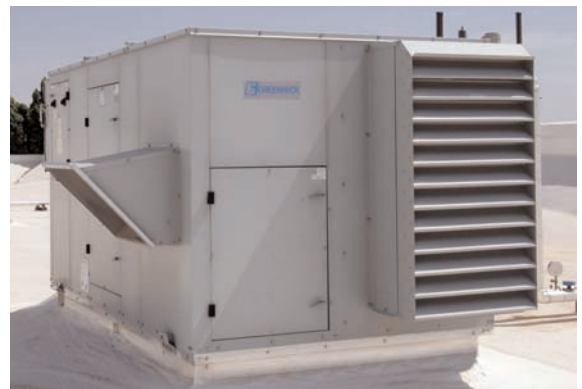
Greenheck's model ERV unit on school rooftop

In 2000, the school district spent millions of dollars cleaning up the mold, but