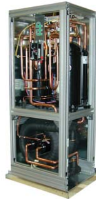
Primary heating and cooling source.