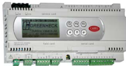
Gives text readouts of operating and alarm conditions.