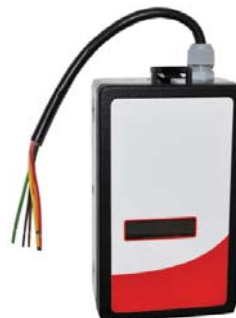
CO2 Sensor Duct Mounted