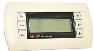
Used with DDC Controller. Input new operating settings and displays alarm conditions.