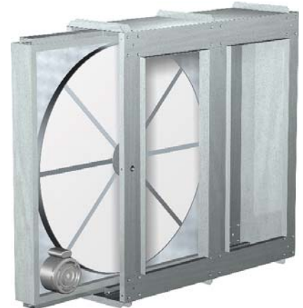
Removable segments for easy maintenance.