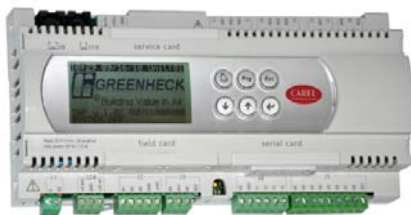
DDC Controller (Microprocessor controller)

Located in unit control center. Permits direct input without ancillary hardware or software.