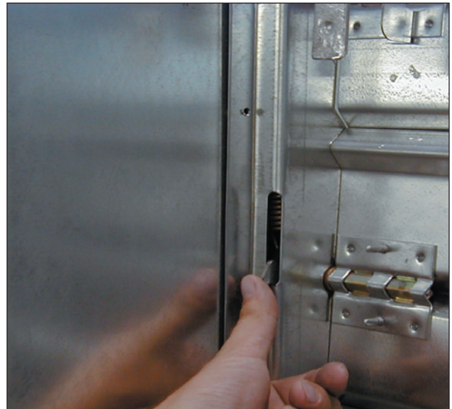
4. Push in lever.