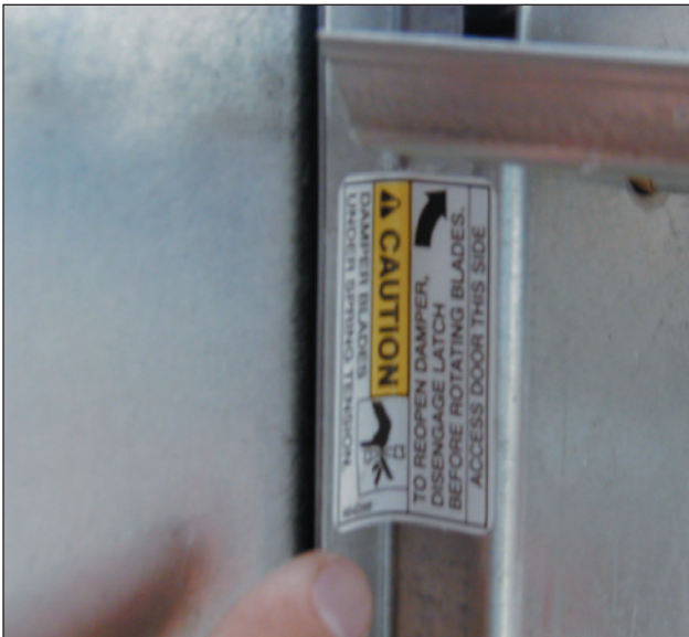
3. Label with instructions on how to open damper.