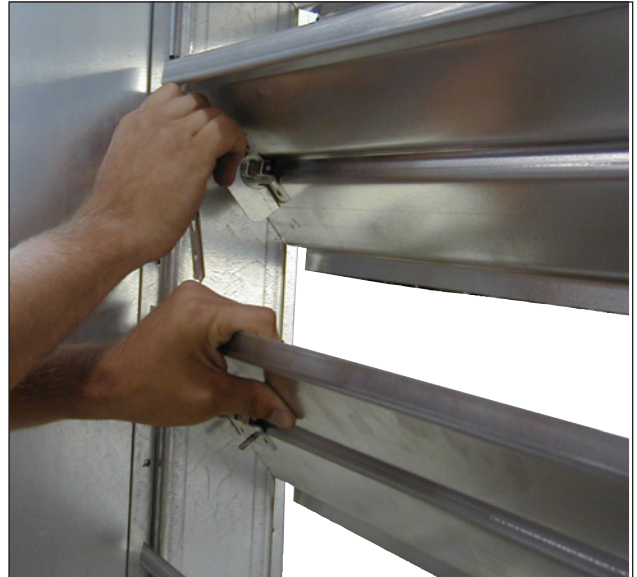
6. Open blades up fully.