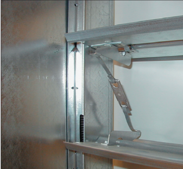
1. Damper in the open position with fusible link attached

These instructions are provided for changing fusible links on DFDTF-210.