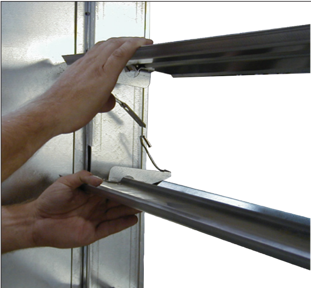
7. Blades fully open.