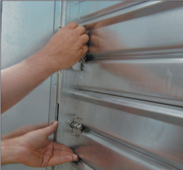
5. Push in lever and grab blade bracket to open blades up.