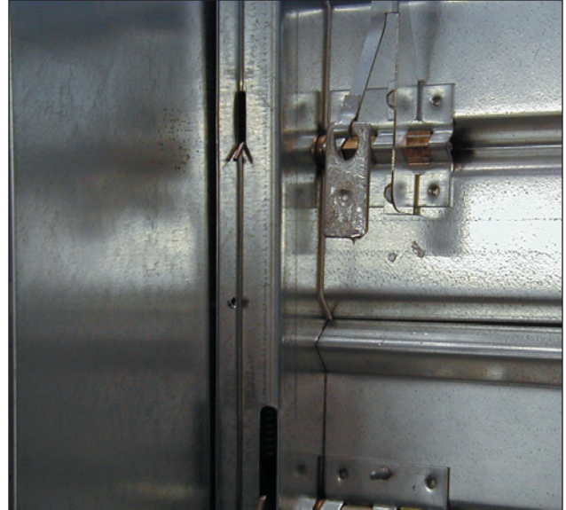
2. Damper in the closed position with melted fusible link. Straighten out upper part of link strap. Remove melted fusible link.