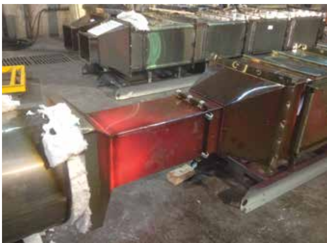
Abnormal Temperature Test PCU must completely contain all smoke and flame to pass UL 1978 test standard. Greenheck unit passed all UL 1978 est criteria.

There are several manufacturers of PCUs. The specifications for most PCU manufacturers state that the unit is listed to UL 710 – Standard for Exhaust Hoods for Commercial Cooking Equipment. Only a few manufacturers specify that their PCUs are listed to UL 1978 – Standard for Grease Ducts. Based on the increased rigor of UL 1978 for fire safety, we recommend that all PCUs be tested and evaluated to UL 1978. Specify with confidence, choose a UL 1978 PCU.