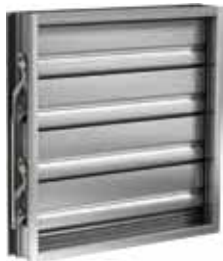
Model ICD-44 and ICD-45 are AMCA Licensed for Air Performance, Efficiency and Air Leakage