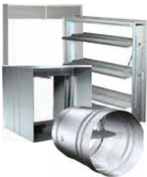
Model DFD-210, DFDAF-310, DFDAF-330 and SEDFD-210 are AMCA Licensed for Air Performance