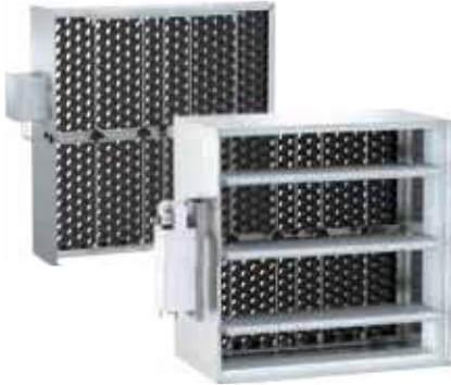
Model AMD-23 and AMD-33 are AMCA Licensed for Air Leakage and Air Performance