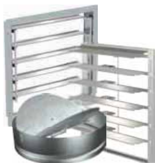
Model BD-100, 320, 330 and ES-30, 31, 32 are AMCA Licensed for Air Leakage and Air Performance