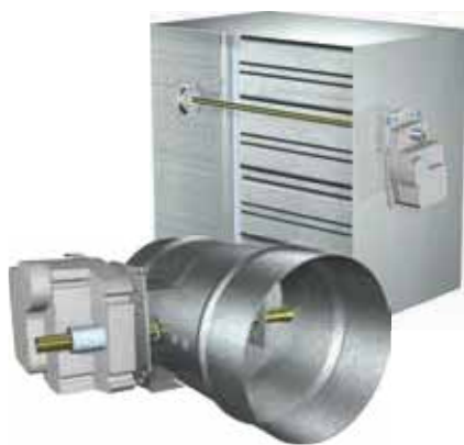
Model SMD-201, 201M, 202, 203, 301, 302, 301M, 302M; SESMD-201 and SSSMD-201 are AMCA Licensed for Air Performance