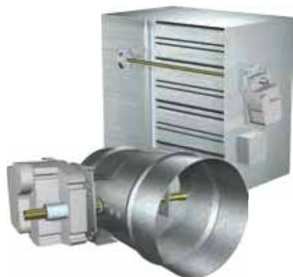
Model CFSD-211, 212; FSD-211, 211M, 212, 213, 311, 311M, 312, 312M, 331; SSFSD-211; SEFSD-211; and OFSD-211, 212, 311, 312 are AMCA Licensed for Air Performance

SE in model name denotes 316 stainless steel SS in model name denotes 304 stainless steel