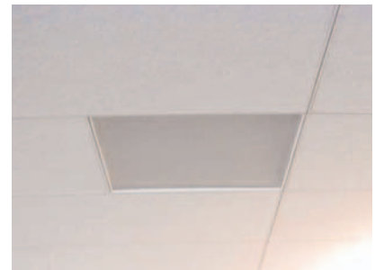
Return air grilles are placed in the position of ceiling tiles as needed.

Mark placed the return air system in the pre-hung ceiling plenum. Return air grilles are placed in the position of ceiling tiles as needed. To exhaust air from conference and break rooms, an acoustical transfer duct is mounted in the dividing