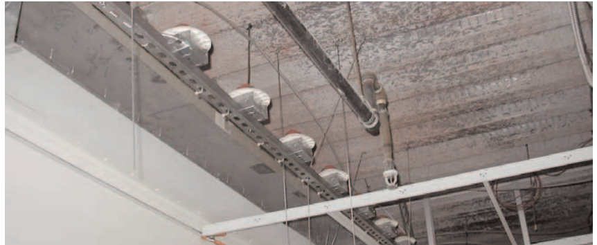
Once in the return air plenum, the air is pulled past smoke detectors and through fire/smoke dampers into the duct chase.

The Capitol Area East End Complex was not designed exclusively as a raised floor application. There are some areas where a concrete slab is poured to simplify the transition between these areas and the adjoining spaces. The