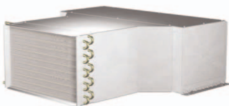
Left – Greenheck's Underfloor Fan Terminal was determined to be the most cost effective way to heat and cool perimeter areas

Because the perimeter loads in buildings can change drastically, Mark designed a system at the perimeter that includes Greenheck's UFT's in both ducted and non-ducted