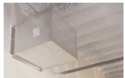
Acoustical transfer duct exhausts air from conference rooms and break rooms.