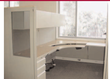
Typical employee office setting. .

As designed, this project will exceed energy standards mentioned in Title 24 Energy code by over 30%. The buildings design is projected to save taxpayers $400,000